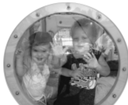
Photos like this, of children playing outdoors, are often e-mailed to parents by Center Coordinator Stacie Kaeuper, so that teachers can see their children at play during the day.

Its "commons area" includes climbing structures, a reading loft, art/puzzle station and small library. The center implements the "High Reach" curriculum, a hands-on program which sparks children's interests based upon their learning styles. The "Pebble Soup" curriculum, also implemented at the district's three early childhood schools, provides a user-friendly early childhood curriculum for the day care center's three- and four-year-old children whose daily routine includes music and movement, circle time, project work, centers, small group instruction and story time.