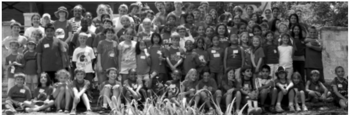
Students in the Plano Regional Day School Program for the Deaf enjoyed the Arbor Hills Nature Preserve this year.

The Plano ISD program serves approximately 300 students from 16 school districts. Students are served in the least restrictive environment, which is determined by the ARD (Admission, Review, Dismissal) committee. Some students are served by itinerant deaf education teachers on the student's home campus, some are served by the deaf education parent advisor in the student's home, and some are served by a combination of regular education and deaf education teachers at these Plano ISD schools: Pearson Early Childhood School, Davis Elementary School, Haggard Middle School, Vines High School and Plano Senior High School.