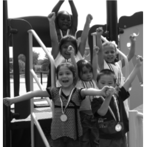
Plano ISD Head Start students celebrate their program's national "Gold Certificate."

The Head Start team has had much to celebrate this school year. In August, the program moved into brand new facilities, with the "rededication" of Meadows Elementary School, Head Start's headquarters. Originally constructed in 1963, Meadows underwent a complete renovation during the past two years as a project of the 2004 bond program. This school year, Head Start staff and students returned to the brand new building to enjoy all new classrooms, parent meeting areas and offices for its family services staff.