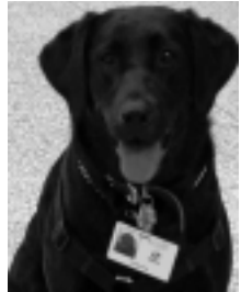
Gypsy bid farewell to her Plano ISD family this month.