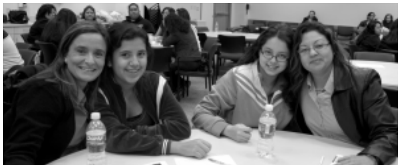
Mothers and daughters participating in the Plano ISD KEYSS (Keeping Education Your Stepping Stone) Program attended a college preparation conference at Collin College sponsored by Destination College and Plano ISD Student and Family Services.

ing and radiology. Some middle schools hosted career days featuring guest speakers with a future focus. The annual district event is coordinated by the office of guidance and counseling. View more school reports and photos online at: www.pisd.edu .