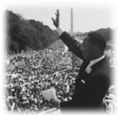
Several hundred thousand people attended a march for jobs and freedom in Washington, D.C., on August 28, 1963, where Dr. Martin Luther King, Jr., delivered his famous "I Have a Dream" speech from the steps of the Lincoln Memorial. Plano East Senior High School students will perform the entire speech at the school district's annual MLK tribute event.