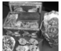
FANS department staff prepared treats for residents of the CITY House youth shelter.

❖ Plano East Senior High School Swim Team donated 1,200 canned goods. Spanish Club and Spanish classes donated $700 through an annual "pass the can" drive to assist three families with a total of 13 children. FCCLA (Family, Community and Career Leaders of America) collected items for Hope's Door women's shelter.