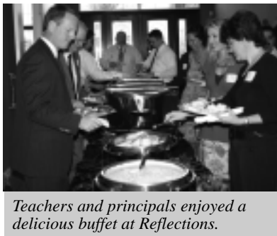
Teachers and principals enjoyed a delicious buffet at Reflections.