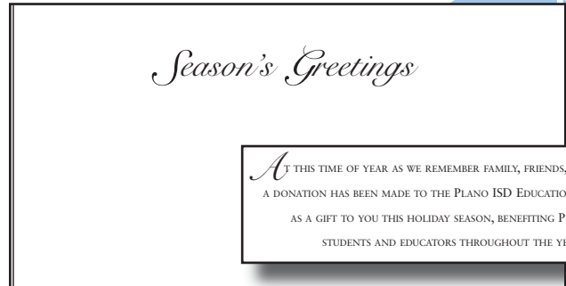
Inside Bottom Panel Boxed area is special gift card insert

Just return this completed form with your advance payment to the Plano ISD Education Foundation, 2700 W. 15th Street, Plano, Texas 75075 OR fax your credit card order to 469-752-8096. Orders must be received by November 7.